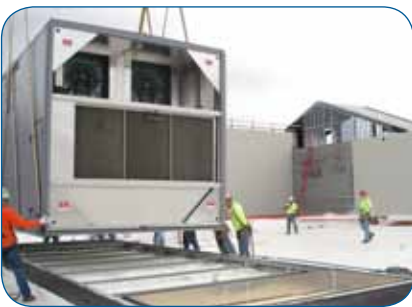
Installation of EnergyPack® fan and coil section on the insulated roof curbs provided by Venmar CES.

The loop water is piped to 14 custom air handlers. Most of these units are located on the building rooftop,