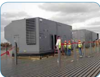
14 units were placed on the rooftop or interior mechanical rooms of the Battle Creek Central High School.