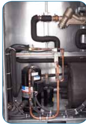
Integrated WSHP with scroll compressor and coaxial heat exchanger.