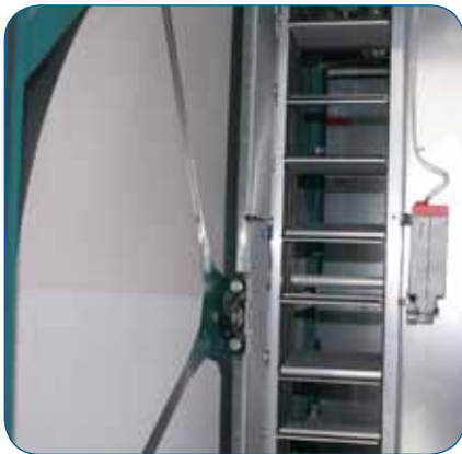
AHRI Certified™ enthalpy wheel performance for sensible and latent heat recovery between air-streams. Damper shown for bypassing wheel during economizer cycle.