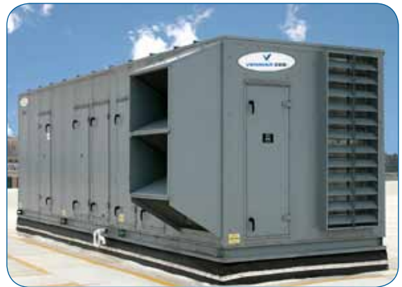
One of the 14 Venmar CES EnergyPack® air handlers ranging in sizes from 3,800 to 42,500 cfm.